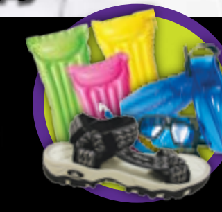
Beach & Water Toys