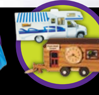
Camping & RV Collectable Toys & Gifts