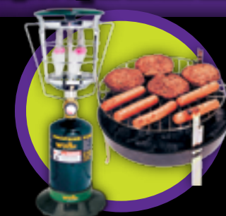
Camping & BBQ

Attend once and see why 95% return to the Wilcor Show every year